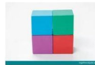
4 block wall

Your child might only be able to use 3 or 4 blocks to build the tower at first. Have your child add more blocks as they are able.